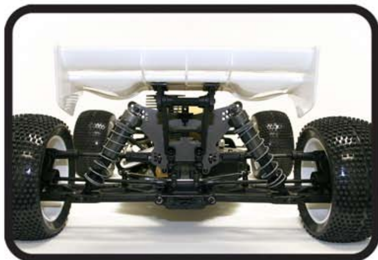
Rear Suspension & 16mm Big Bore Shocks